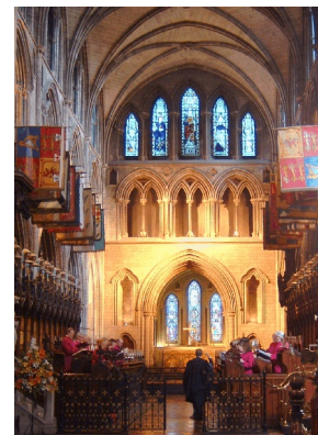
In St. Patrick' Cathedral, Dublin. May 2008

In May 2008, we sang the Offices in St. Patrick's Cathedral, Dublin and in August doing the same in Southwell Minster.