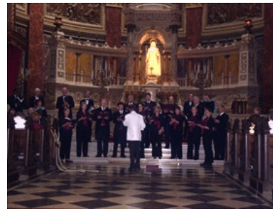
In Budapest May 2007

We sang Evensong in the wonderful St. Nicholaaskerk, Amsterdam in 2006 and in St. Stephen's Basilica and Estergom Cathedral in Budapest during 2007.