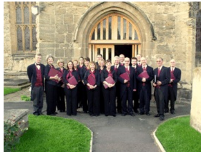
Before a Concert at Warkworth in July 2007

We visited Northumbeland in July 2007 and sang the Office in Hexham Abbey.