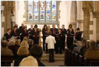
The Heritage Singers in Concert at St. Peter's Church, Thorner, Leeds.

The choir exists to continue the long tradition of choral music which has existed in the Church in England since Tudor times. It has been in existence for thirteen years, being formed initially from church musicians whose local choir was no longer viable. The choir sings mainly for Anglican or Church of England Services but has also sung for services in Churches of other traditions and aims to produce an English choral sound in the music sung.